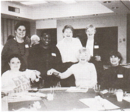
POINT volunteers enjoying themselves

On Thursday, April 22, 1999 POINT volunteers were recognized for their tremendous ongoing contribution and commitment at the first annual POINT Volunteer Appreciation Reception, held during National Volunteer Week '99.